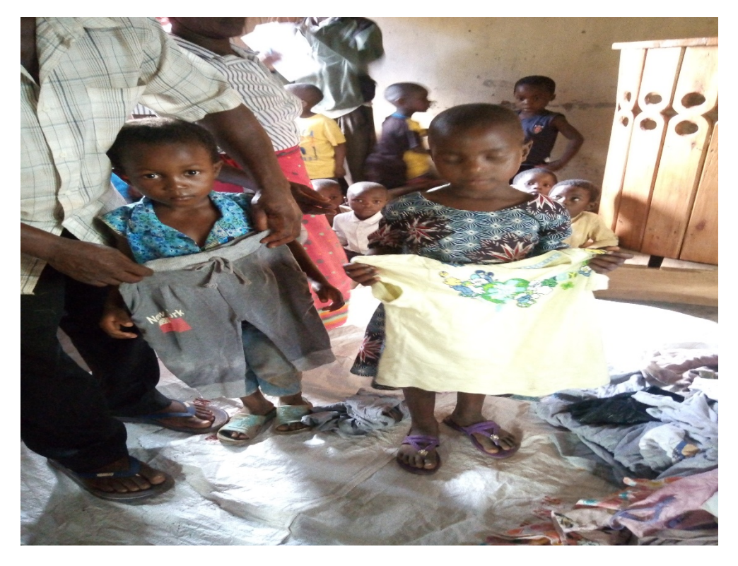
Figure 8: CHILDREN WITH THEIR NEW CLOTHES