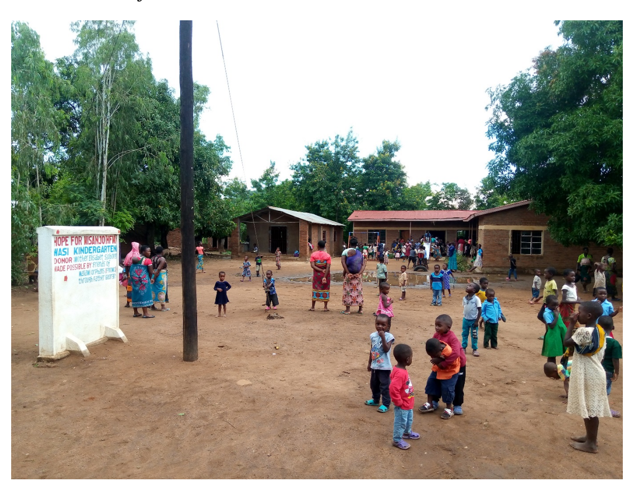
Figure 1: CHILDREN PLAYING OUTSIDE ONE OF OUR CENTRES

The pictures below shows some of the activities happened, the items & distribution activities carried out and how successful they were conducted. The celebration exercises were done in all HFM centres namely Ekhamunu, Wasi and Misanjo.