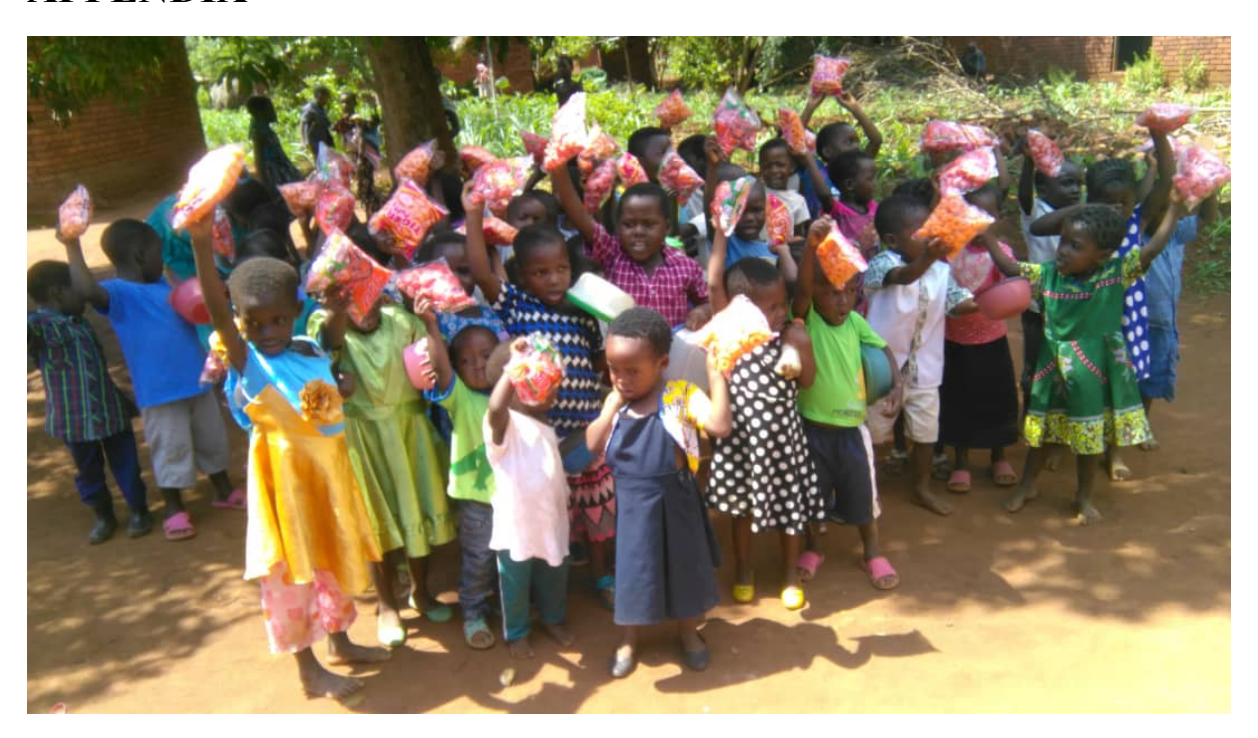
Figure 7: CHILDREN WITH THEIR SNACKS IN HAND