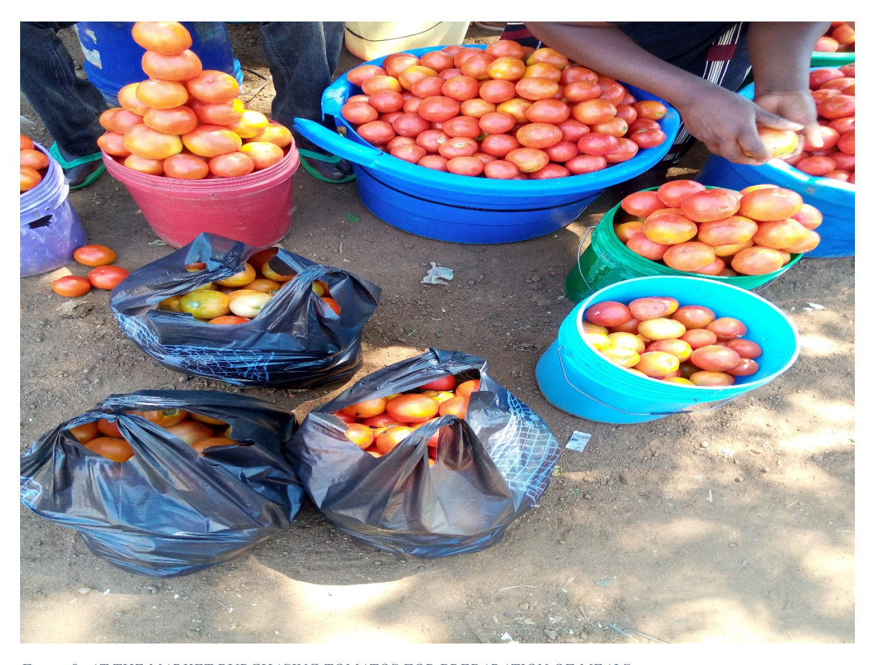
Figure 9: AT THE MARKET PURCHASING TOMATOS FOR PREPARATION OF MEALS