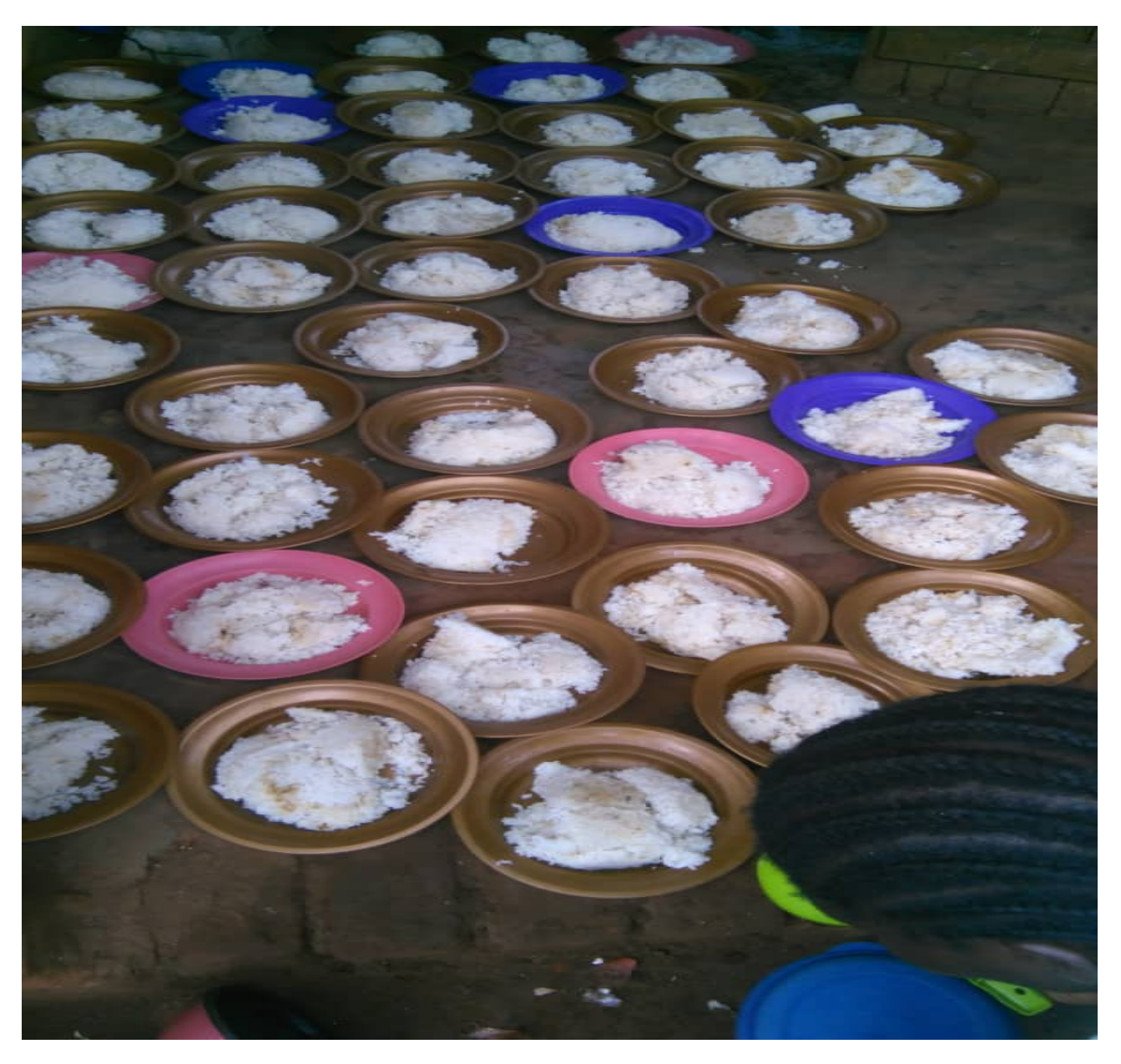
Figure 5:PLATES OF FOOD FOR THE CHILDREN